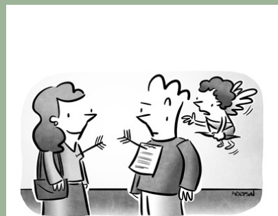
"If you could fill out the attached survey that would really help me out."